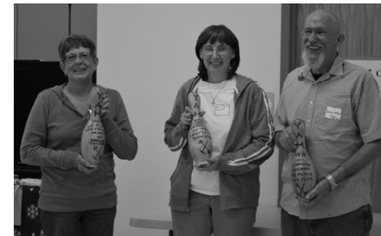
Pinedale took 2nd Place for High Team Average